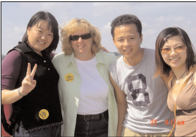
A group of 42 international students and their chaperones visited Amish Country in Holmes County July 22. The trip was planned to teach the students more about the Amish culture.