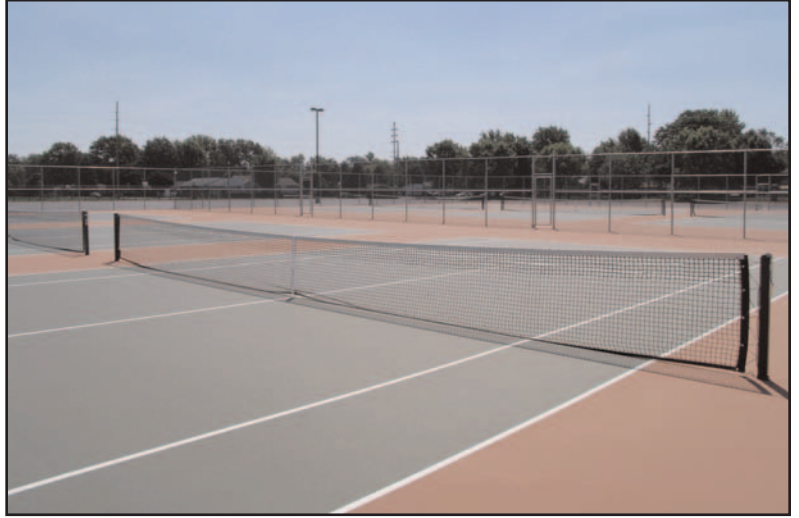
The new tennis courts officially opened Friday, Aug. 12 with a UF Tennis Tournament.

The six tennis courts are the second phase of the sports facilities to be completed at the Armstrong Sports Complex, which was established in 2002. The Armstrong gift allowed for installation and construction of the