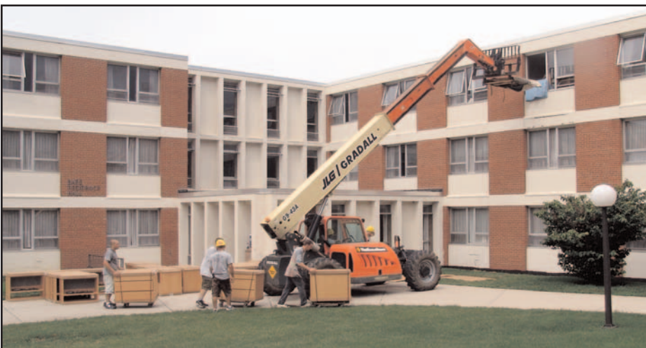
New furniture for the third floors of Bare and Fox residence halls was moved in with the assistance of a lift during the last week of July. The rooms and student lounge areas were renovated this summer, and now feature new paint, carpet and furniture.

FYI is published by the Office of Public Information. Contact Rebecca Shell at x4345 or at shell@findlay.edu to submit information.