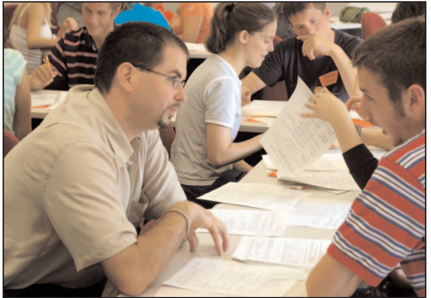
New students go over class schedules with their advisers during new student registration on Aug. 8.