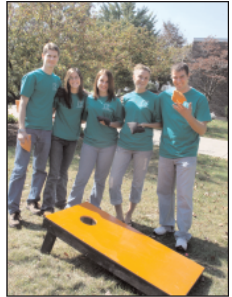
Physician assistant (PA) day was held earlier this month. Students in the PA program played a competitive game of corn hole as part of the activities.