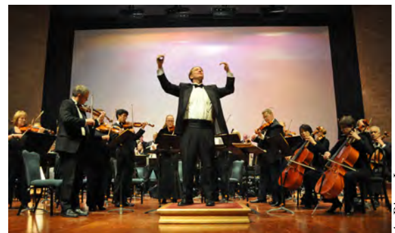
The Toledo Symphony Orchestra performs during last season's Concert and Lecture Series.

The Toledo Symphony Orchestra also will perform Friday, Jan. 27, 2012, and Friday, Feb. 24, 2012, as part of the Concert and Lecture Series.