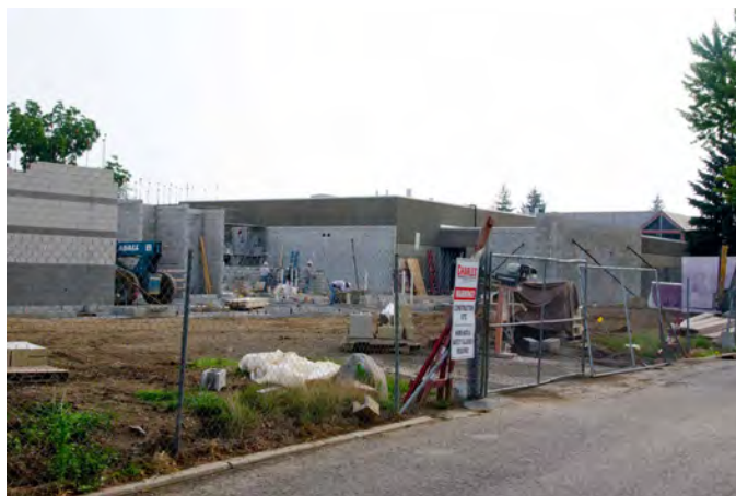
The exterior of the Davis Street Building is taking shape. By December, crews plan to have the main shell completed to work on interior spaces during the winter months.

Blue-light phones and additional parking lot lighting were installed outside of 401 and 349 Trenton Ave., as well as outside Oiler Pointe, the newest housing option located on the corner of Morey Avenue and West Foulke Avenue.