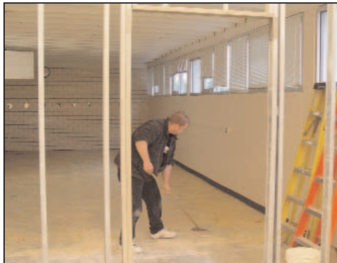
Summertime construction projects have begun on campus. Some of the bricks in the sidewalks around parking lot P1 have been refurbished or replaced for safety and aesthetic reasons. Renovations of the chemistry laboratories on the third floor of the Frost Science Center also is underway. The labs are being renovated to meet students' growing need for updated chemistry facilities.