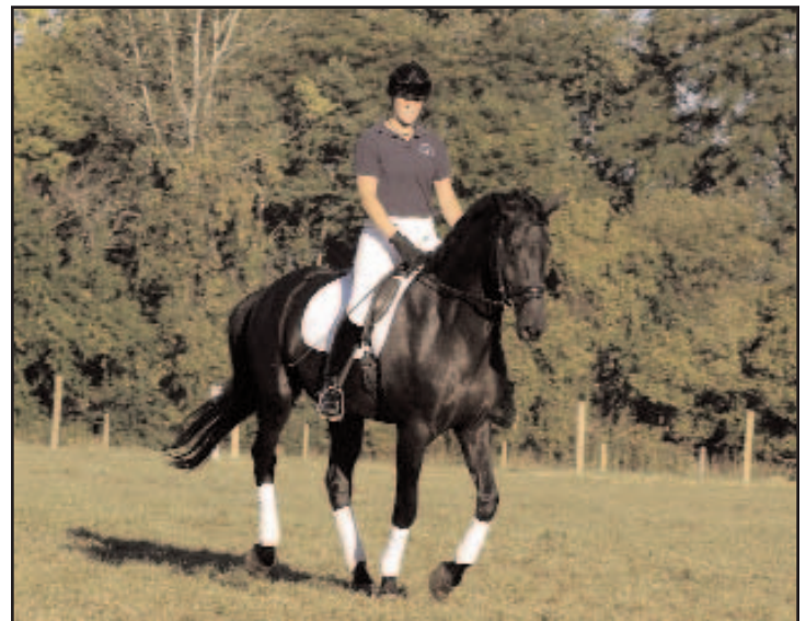
A student practices her dressage technique at the James L. Child Jr. Equestrian Complex.