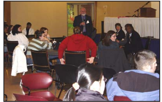
HLC consultant-evaluators met with groups of students, faculty and staff as part of their site visit at the University.