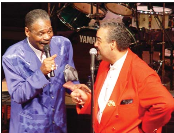
A sizable crowd enjoyed the music of The Stars of the Platters, Drifters and Coasters as part of the University's new Concert and Lecture Series.