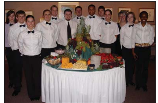
Students in the hospitality management program served the food at the Mazza Campaign Kick-off event Feb. 26.