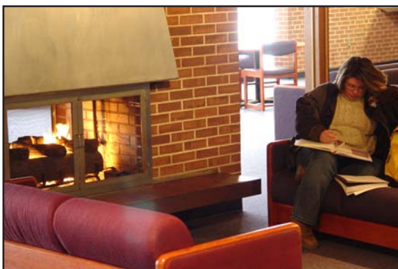
Studying in front of a fire in the Alumni Memorial Union helps students bear up under the cold of winter.